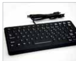
Fully Sealed Keyboard