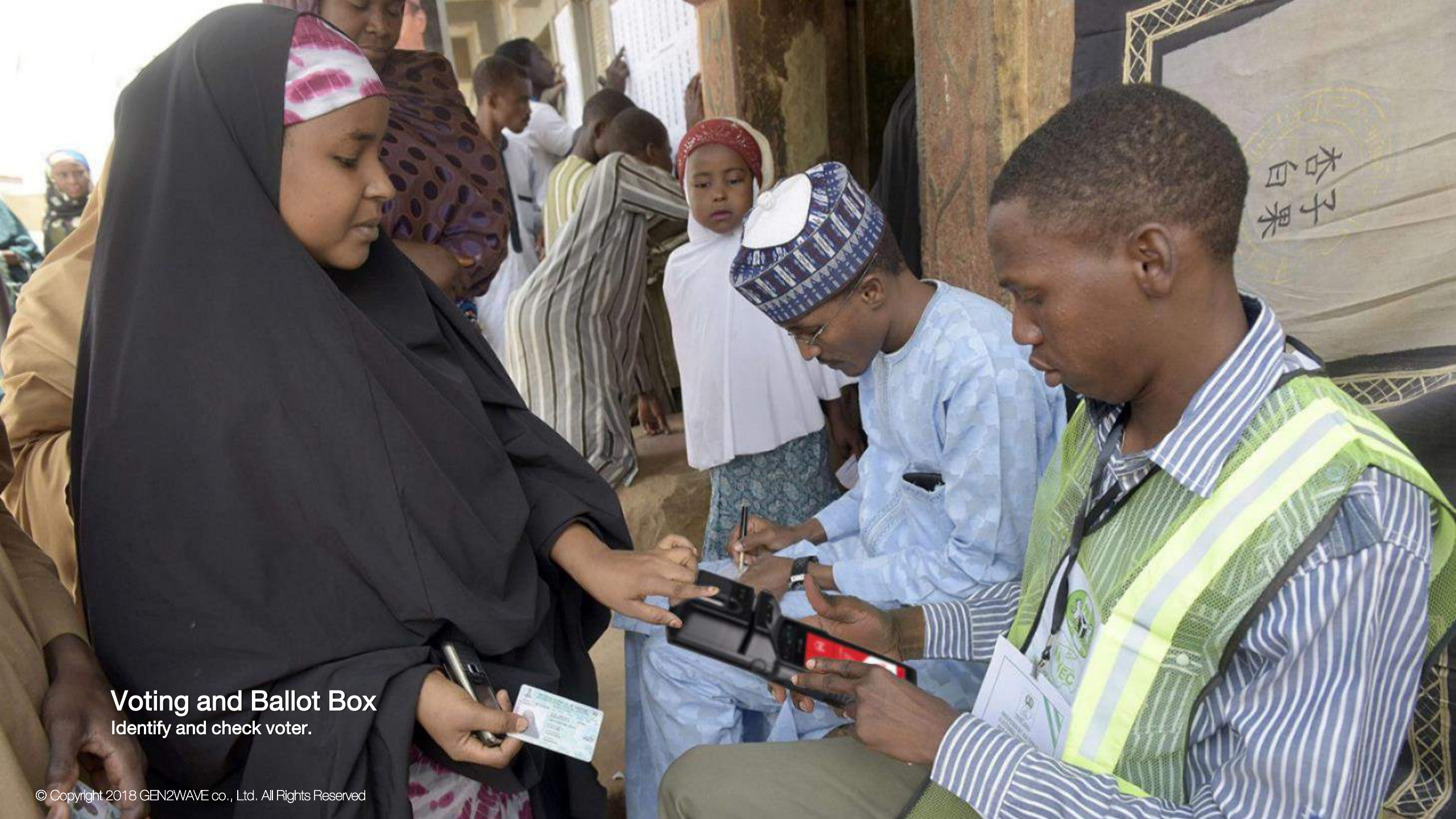
Voting and Ballot Box Identify and check voter.